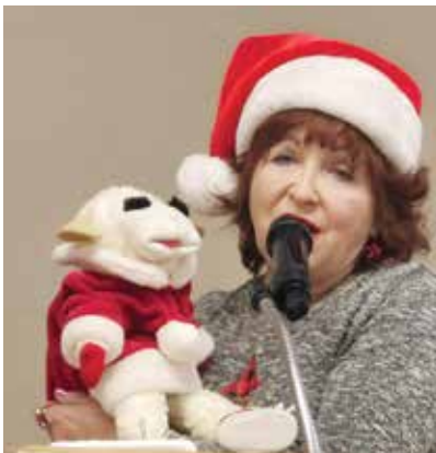
TOPS P. 14