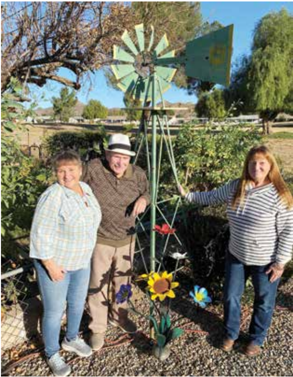
WIND POWER IN SUN CITY P. 5