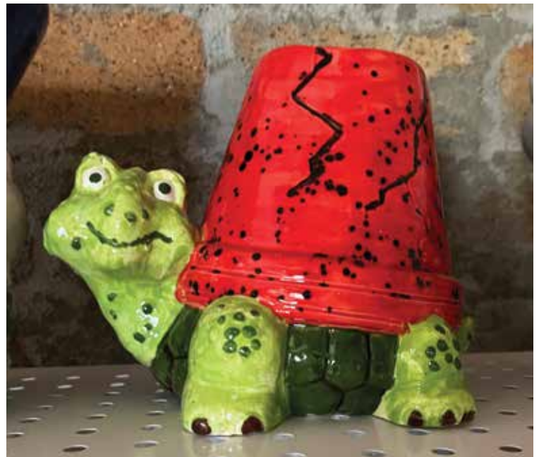
CERAMIC CLUB P. 13