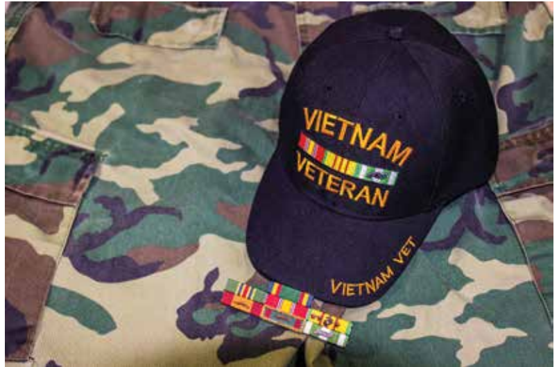
HONORING VIETNAM VETERANS P. 9