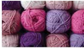
Senior Knitters & Crocheters of Menifee

Knitters are off to a great start! We had a great first two weeks in January. During our first meeting on the 7th, we had 89 items donated for our recipients. We continue to grow, and our ladies keep the Afghans, hats, shawls, scarfs, baby blanket and hats, and other items coming every week. Pictured at right are a large multi-colored Afghan and a baby blanket, both made by our members.